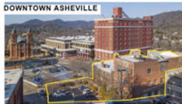
DOWNTOWN ASHEVILLE 60 Haywood Street #4B, Asheville $499,000 MLS#4113967