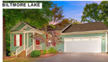
BILTMORE LAKE www.5HooletCourt.com $750,000 MLS#4159229