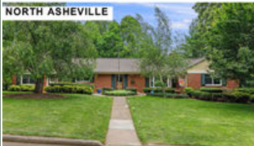
NORTH ASHEVILLE www.4DogwoodRoad.com $1,200,000 MLS#4142019