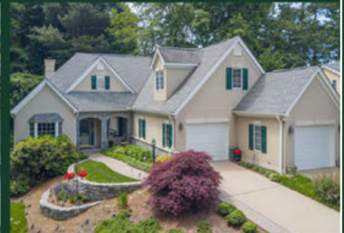
2 BIDEFORD ROW, ASHEVILLE $1,249,000 MLS#4145360 ACR:0.26 3,794 SQFT. DEVONSHIRE www.2BidefordRow.com