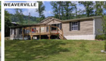
WEAVERVILLE 196 McKinney Road, Weaverville $350,000 MLS#4162628