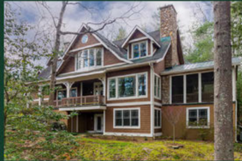
343 RACQUET CLUB ROAD, ASHEVILLE $2,750,000 MLS#4150699 ACR:1.00 6,013 SQFT. ASHEVILLE www.343RacquetClubRoad.com