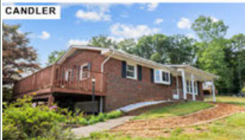
CANDLER www.40PeteLuther.com $425,000 MLS#4162506