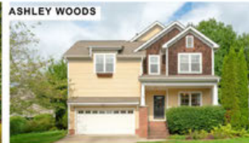
ASHLEY WOODS www.168CarolinaBluebird.com $650,000 MLS#4162503