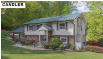
CANDLER www.84PineTreeDrive.com $519,500 MLS#4132653