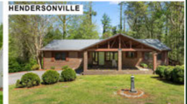
HENDERSONVILLE www.316SouthRugbyRoad.com $539,000 MLS#4131692