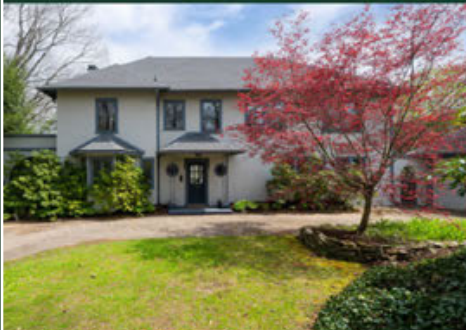
38 LAKEVIEW ROAD, ASHEVILLE $1,750,000 MLS#4124849 ACR:0.44 3,318 SQFT. LAKEVIEW PARK www.38Lakeview.com