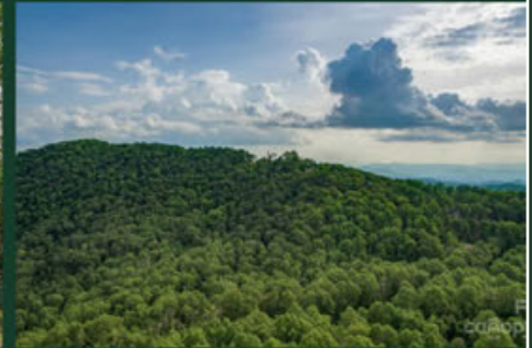
1300 ELK MOUNTAIN SCENIC HIGHWAY $1,795,000 MLS#4035598 ACR:13.94 UNOBSTRUCTED MOUNTAIN VIEWS www.1300ElkMountainScenicHighway.com