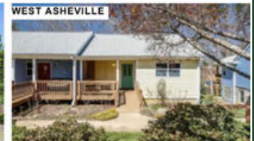
WEST ASHEVILLE www.VermontCourtA4.com $429,000 MLS#4116699