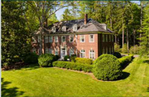
407 VANDERBILT ROAD, ASHEVILLE $4,950,000 MLS#4104878 ACR:4.67 TOTAL 9,168 SQFT. BILTMORE FOREST www.407VanderbiltRoad.com