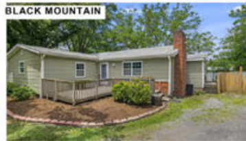
BLACK MOUNTAIN www.408BlueRidgeRoad.com $370,000 MLS#4146025