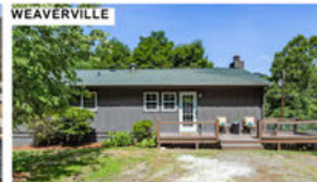
WEAVERVILLE www.12MooneyLane.com $485,000 MLS#4155351