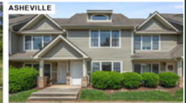
ASHEVILLE www.10RotundaCircle.com $318,200 MLS#4147190

Since 1968 Preferred Properties has been a trusted name in the Asheville real estate market. www.PreferredProp.com